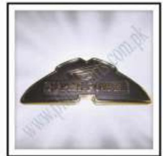
PF-P07-051 (Front Logo With File Print SP-70CC)