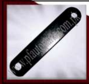
TF-010-050 (Bracket Mounting Fuel Tank)