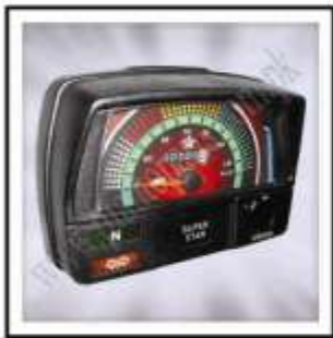
WF-SS3-106 (Meter SS-70CC 2015)