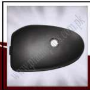
PF-100-082 (Trunk Cover Right 100CC)