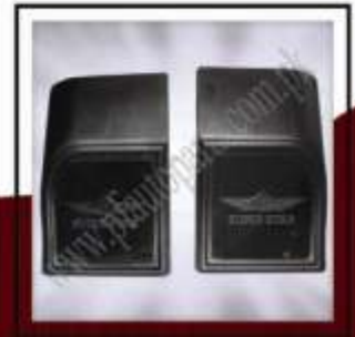
PF-CNG-020 (Rear Mudflap L & R (Rickshaw) CNG)