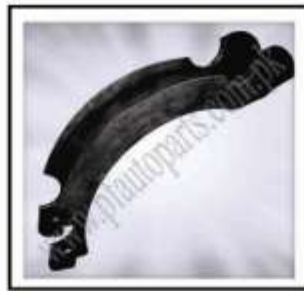
MF-RR1-020 (Support Plate Cylinder UP-44 CNG)