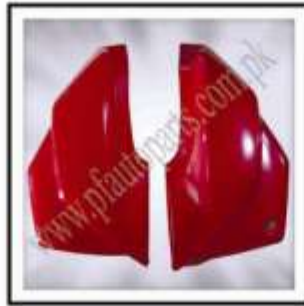
PF-125-035 (Side Cover L & R SP-125CC NM)