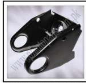
MF-RR1-070, MF-RR1-075 (Fork Ear Small Pipe RH & LH (FP06) CNG)