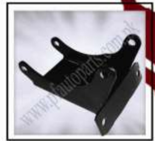
MF-R01-205 (Engine Clamp Rear Foundation CNG)