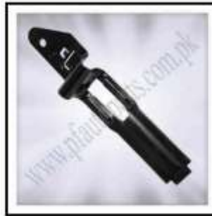
MF-M01-100 (Battery Support 70CC)