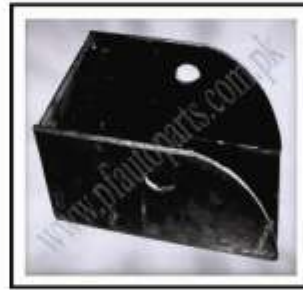
MF-R01-112 (Front Bracket Leaf Spring CNG)