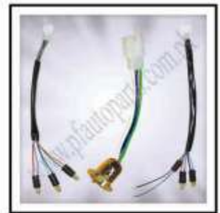
002507 (Head Light Holder Lead)