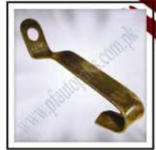
MF-M01-500 (Ignition Coil Patti 70CC)