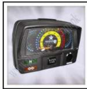
WF-SS3-104 (Meter SS-70CC)