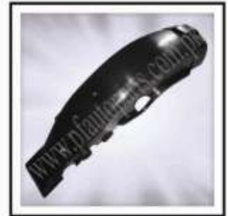
PF-125-057 (Rear Fender Inner 125CC)