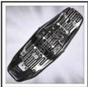
PF-125-030 (Seat Plate 125CC)