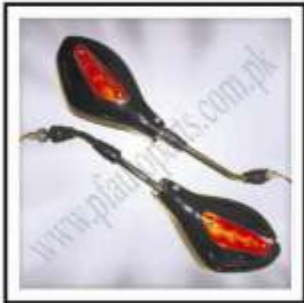
002505 (Side Mirror DX SS-70CC)