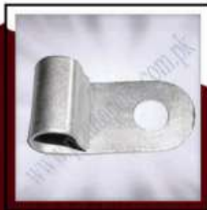
MF-T03-010 (Clip Wire Harness PVC SP-70CC)