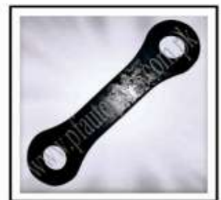
TF-010-020 (Link Actuator)