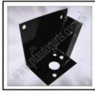
MF-R01-080 (Master Cylinder Bracket CNG)