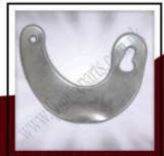
MF-M01-200 (Moon Patti 70CC)