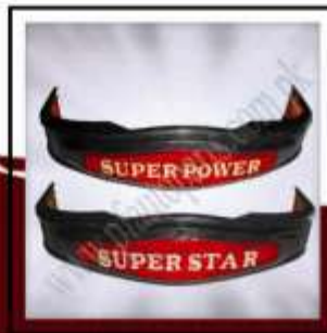
002500 (Front Logo SS-70CC 2015)