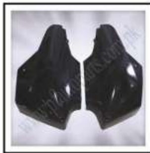
PF-100-036 (Side Cover L & R 100CC SP NM)