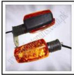
WF-SP1-030, WF-SP1-032 (Indicator Rear & Frnt SP-70CC 10-LED)