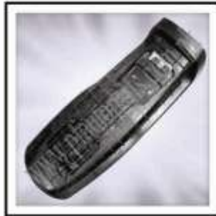
PF-070-106 (Seat DX SS-70CC)