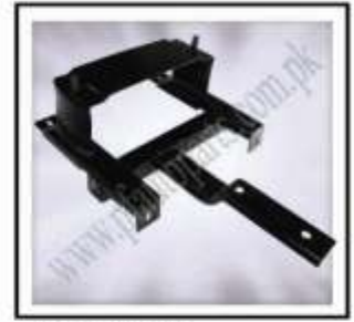
MF-R01-010 (Spare Wheel Bracket (SP) CNG)