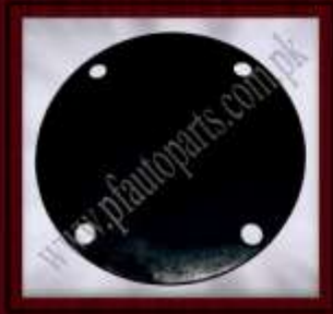
TF-010-030 (Side Plate Centre Ford)