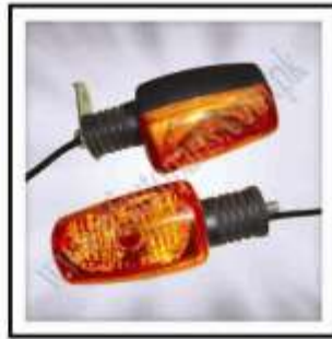
XW-F020-107 (Indicator Rear & Frnt SP-70CC BLB)