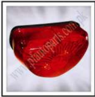
WF-SS2-010 (Back Light SS-70CC 2014)