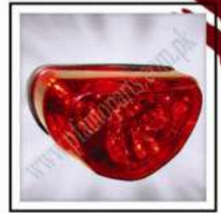
WF-SS2-008 (SS70CC Taillight 2012)