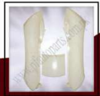
PF-070-103 (Seat Cowl DX SS-70CC)