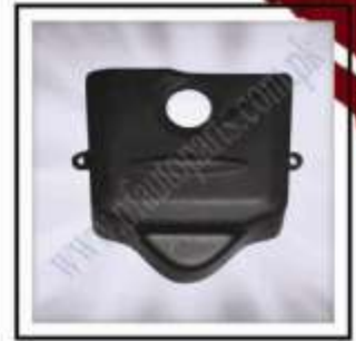
PF-125-025 (Ignition Cover 125CC)