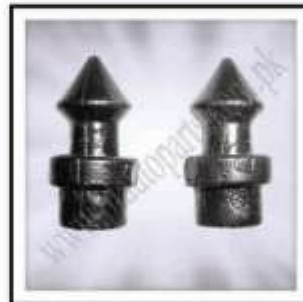
PF-125-070 (Side Cover Bolt 125CC)