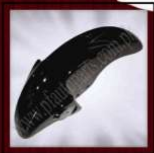
PF-100-050 (Front Fender 100CC)