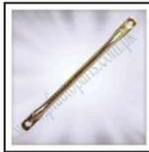
MF-M01-090 (Limiter Pipe 70CC)