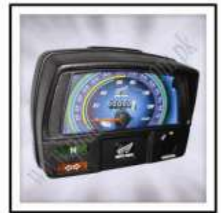
WF-SP3-110 (Meter SP-70CC 2014)