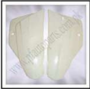
PF-070-100 (Side Cover L & R DX SS-70CC)