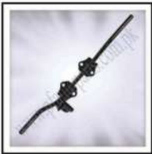
MF-M01-020 (Foot Rod 70CC)