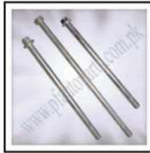
MF-M01-812 (Center Axle 70CC)