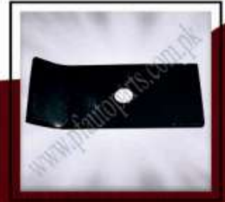
TF-010-061 (Clamping Bracket L-Tube)