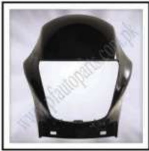
PF-100-010 (Head Light Case 100CC)