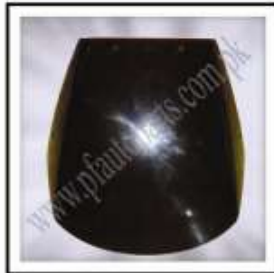
002506 (Head Light Shed DX SP-70CC)