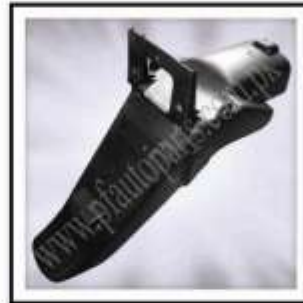
PF-125-055 (Rear Fender Black Outer 125CC)