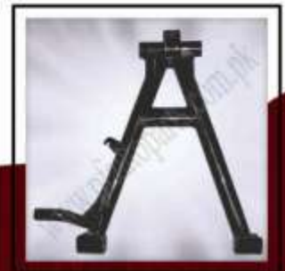
MF-M05-060 (Main Stand 100CC)