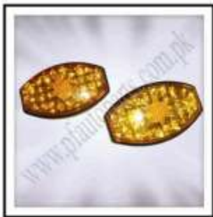
PF-S07-020 (Reflector SS-70CC)