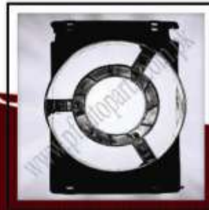
PF-CNG-010 (Radiator Fan Cover (Rickshaw) CNG)