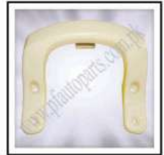
PF-070-104 (Seat Carrier DX SS-70CC)