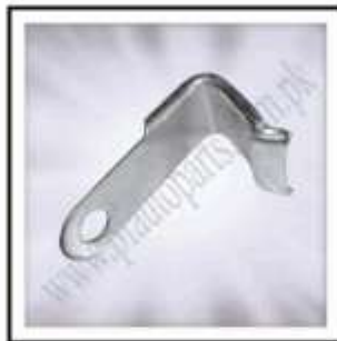
MF-T00-050 (Cable Patti 70CC)