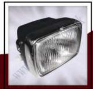
WF-SP4-150 (Head Light SS-70CC 2015)