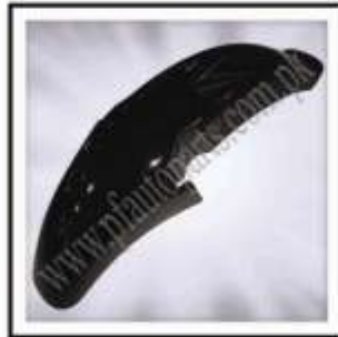
MF-M07-010 (Frnt Fender 125 CC)