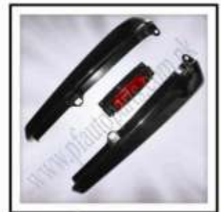
PF-070-030 (Seat Coupler + Joint 70CC)