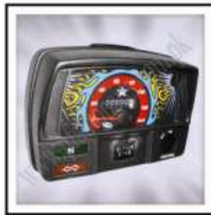
WF-SS3-105 (Meter SS-70CC 2014)