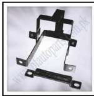
MF-M05-070, MF-M05-080 (Battery Stand & Support Patti 100CC)