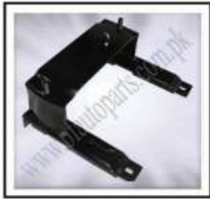
MF-R01-020 (Spare Wheel Bracket (SS) CNG)