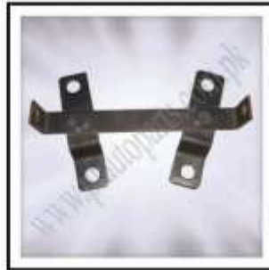
MF-M01-142 (Meter Support DX SP-70CC)