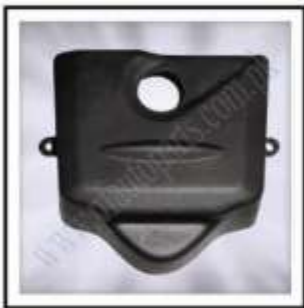
PF-100-025 (Ignition Cover 100CC)