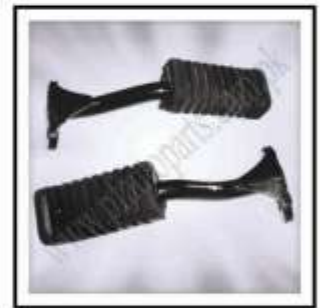
MF-M05-020 (Footrest Rod Set 100CC)