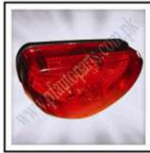
WF-SP2-010 (Back Light SP-70CC 2014)