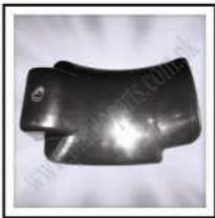
PF-125-059 (Rear Fender Attachment 100CC)