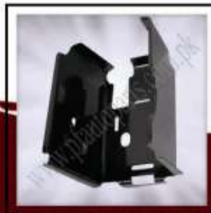
MF-M01-110 (Battery Box 70CC)