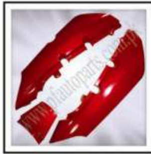
PF-100-040 (Seat Cowl 100CC)