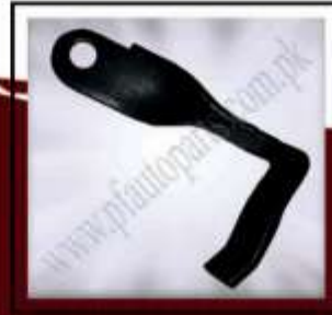
TF-010-060 (Bracket L-Tube)