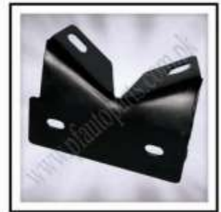
MF-M01-130 (Tool Box Support 70CC)