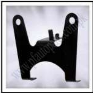
MF-M01-030 (Logo Bracket 70CC)