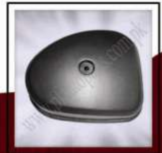
PF-100-080 (Trunk Cover Left 100CC)