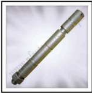
MF-M01-820 (Main Stand Pin 70CC)