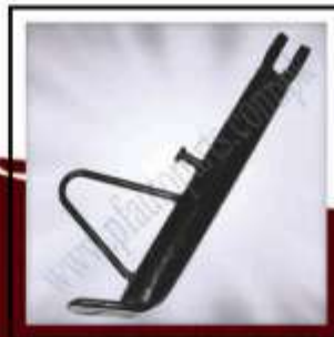
MF-M05-090 (Side Stand 100CC)