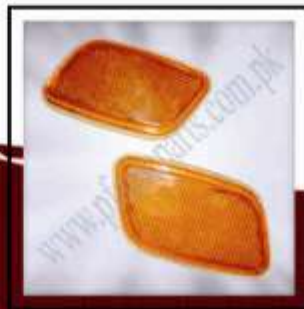
002504 (Reflector DX SS-70CC)