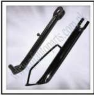
MF-M01-010 (Side Stand 70CC)