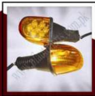
WF-SS1-500 (Indicator DX SS-70CC)