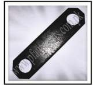
TF-010-010 (Brake Pin Plate Ancker Stud)