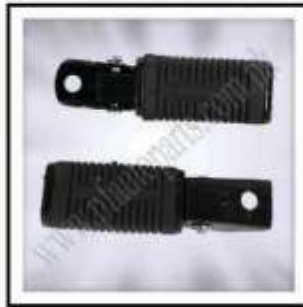
MF-M01-060 (Single Footrest 70CC)