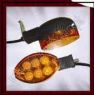
WF-SS1-001 (Indicator Rear & Frnt SS-70CC 6-LED)