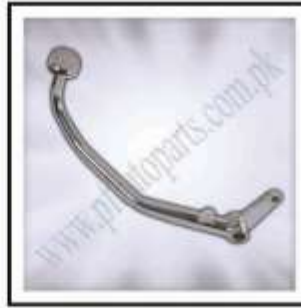
MF-M01-080 (Brake Paddle 70CC)