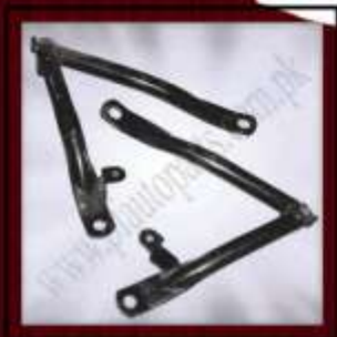
MF-M05-055, MF-M05-050 (Footrest Bracket L & R 100CC)