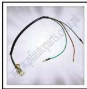
WF-HM1-300 SP (LED Back Light 70CC 2014)