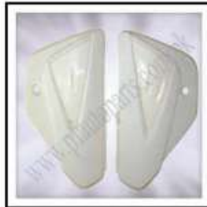
PF-070-25 (Side Cover DX SP-70CC)