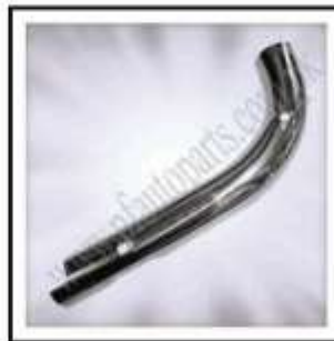
MF-T00-020 (Exhaust Cover Pipe 70CC)