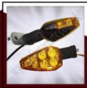
WF-SS1-005, WF-SS1-007 (Indicator Rear & Frnt SS-70CC 9-LED 2012)