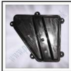
PF-125-090 (Tool Box Cover 125CC)