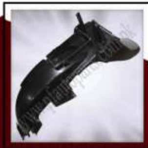
PF-100-055 (Rear Fender 100CC)