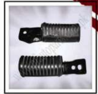
MF-M05-015 (S-Footrest 100CC)