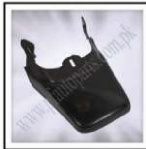
PF-070-042 (Mud Flap Rear 70CC)