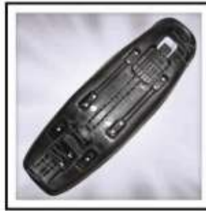
PF-100-031 (Seat Plate 100CC)