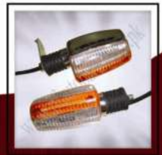
WF-SP1-035, WF-SP1-036 (Indicator Rear & Frnt SP-70CC 2-LED)