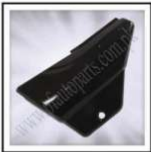
PF-070-020 (Side Cover L & R 70CC)