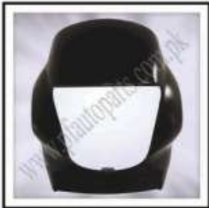
PF-125-010 (Head Light Case 125CC)