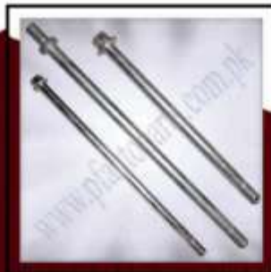
001297 (Center Axle 100CC)