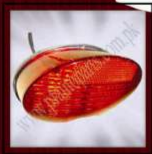
PF-070-100 (Backlight DX-70CC)