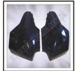
PF-100-035 (Side Cover SS-100CC)