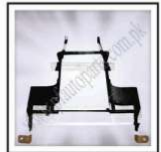
MF-M07-010 (Head Light Bracket 125CC)