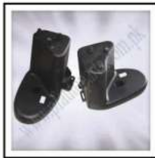
PF-100-090 (Air Cleaner Box 100CC)