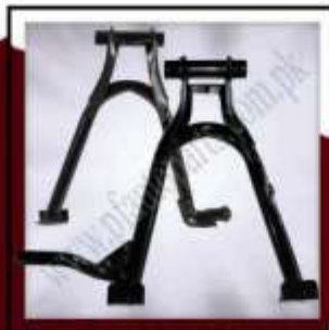
MF-M01-070 (Main Stand 70CC)