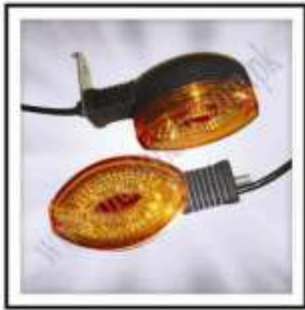
XW-F02-105, XW-F02-106 (Indicator Rear & Frnt SP-70CC 8-LED)