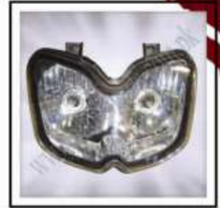
WF-SS4-100 (Head Light DX SS-70CC)