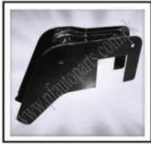
MF-RR1-095 (Channel Bracket Front (FP09) CNG)