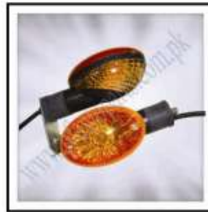
WF-SS1-013, WF-SS1-012 (Indicator Rear & Frnt SS-70CC 2014)