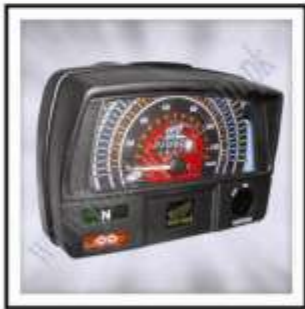
WF-SP3-100 (Meter SP-70CC)