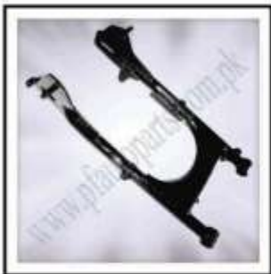
MF-M01-160 (Rear Fork 70CC)