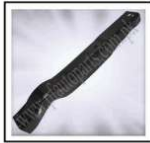
MF-RR2-035 (Gadri CNG)