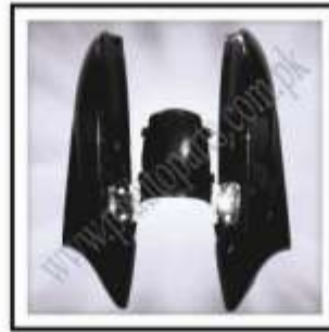
PF-125-040 (Seat Coupl Joint 125CC)