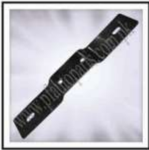
MF-M05 010 (Number Plate Bracket 100CC)