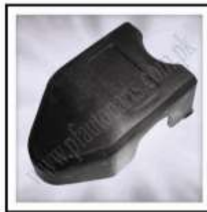
PF-100-020 (Handle Cover 100CC)