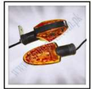
WF-SP-045, WF-SP-047 (Indicator Rear & Front SP-70CC)