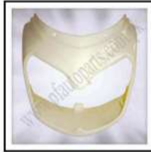
PF-070-101 (Head Light Case DX SS-70CC)