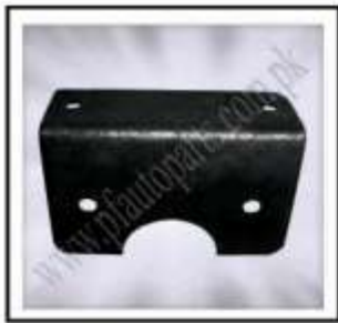
MF-R01-190 (Air Cleaner Bracket CNG)