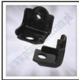
MF-M01-055 (Seat Assembly Bracket 70CC)