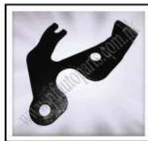
TF-010-018 (Bracket Pedal Spring)