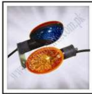
WF-SS1-018, WF-SS1-020 (Indicator Rear & Frnt (B+3LED)SS-70CC 2014)