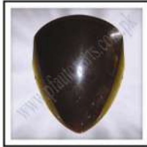
PF-070-102 (Head Light Shed DX SS-70CC)