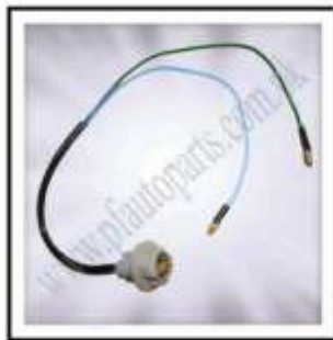
WF-HMI-105 (IND.LED Blue 2014)