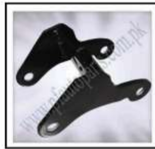
MF-R01-200 (Foundation CNG)