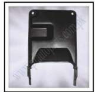
PF-100-060 (Tool Cover 100CC)