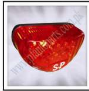
WF-SP2-001 (Back Light SP-70CC LED)