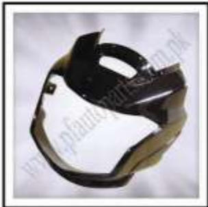
PF-070-120 (Head Light Case DX SP-70CC)