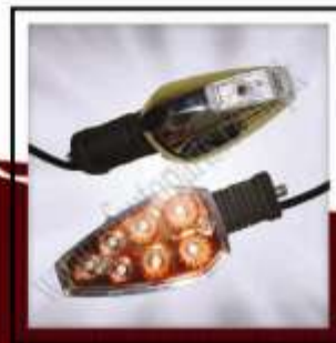
WF-SS1-010, WF-SS1-011 (Indicator Rear & Frnt SS-70CC 9-LED 2013)