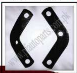
TF-010-012 (Bracket Chik Chin Left Hand Ford 3600)