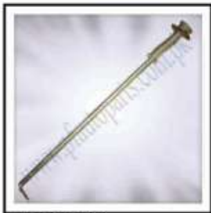
MF-T00-030 (Brake Rod 70CC)