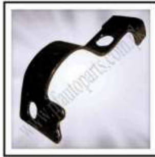
MF-M01-240 (Reflector Support 70CC)