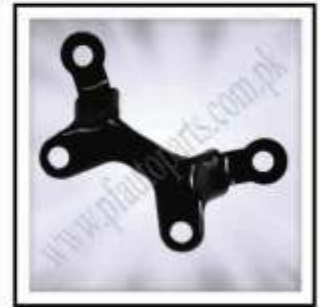
MF-M01-140 (Meter Support SP-70CC)