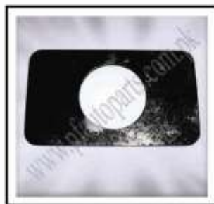
TF-010-016 (Cover Cam Shaft Hole)