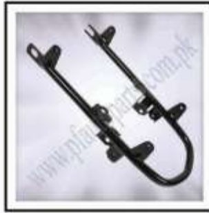
MF-M01-050 (Seat Assembly 70CC)