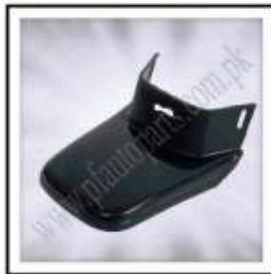
PF-070-040 (Mud Flap Front 70CC)