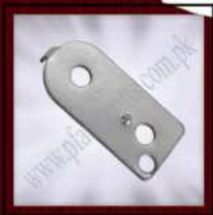
MF-M01-230 (Ind. Patti 2-LED)