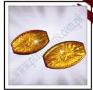
PF-S07-022 (Reflector SS-70CC 2014)