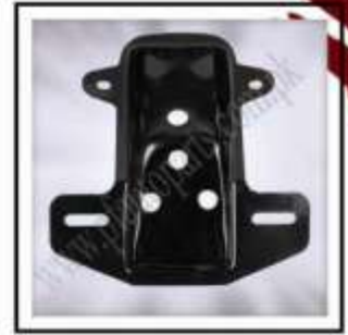
MF-M01-120 (Tail Light Support 70CC)