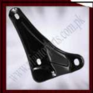
MF-M01-040 (Cylinder Support 70CC)